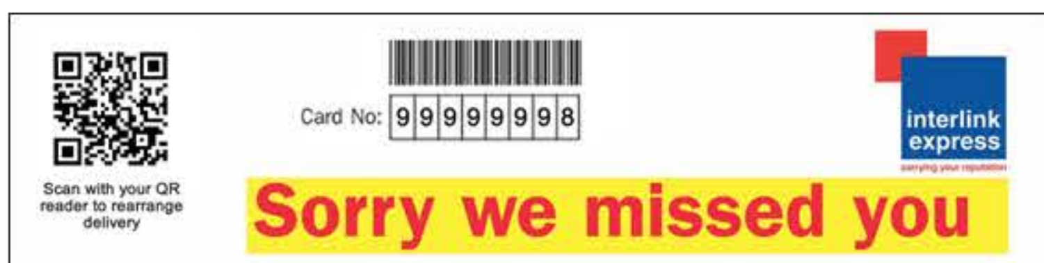
Interlink Express's 'Sorry we missed you' cards will now carry a QR code

Interlink Express has also harnessed the power of QR codes to make it even easier for receivers to reorganise delivery. Using their mobile device, your customers can quickly scan their calling card's QR code using a QR reader, which will take them straight to the relevant web page.